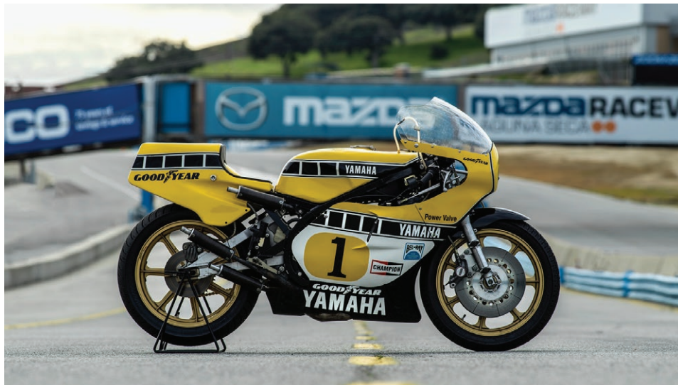
Kenny Roberts' championship-winning Yamaha YZR500 at Mazda Raceway Laguna Seca

rose to dominance by producing two world champions in Wayne Rainey and John Kocinski, winners of the 500cc and 250cc titles, respectively. Rainey would go on to win two more championships for Marlboro Team Roberts in 1991 and 1992. In 2000, Kenny Roberts Jr. won the World 500cc Grand Prix, marking the first time that the son of a former champion won the title.